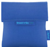
Pantone 301 U