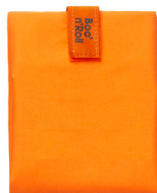
Pantone 021 U