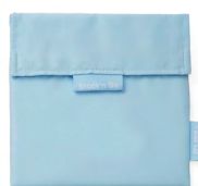
Pantone 277 U