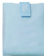
Pantone 277 U