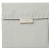
Pantone 427 U