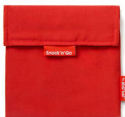
Pantone 186 U