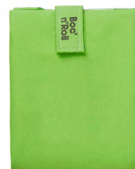
Pantone 375 U