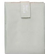
Pantone 427 U