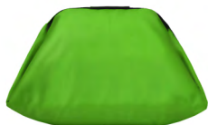
Pantone 375 U