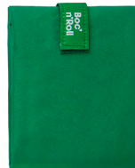
Pantone 2418 U