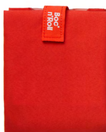
Pantone 186 U