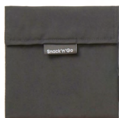
Pantone 447 U