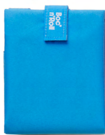
Pantone 2382 U