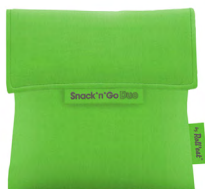
Pantone 375 U