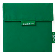
Pantone 2418 U