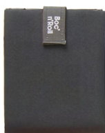
Pantone 447 U