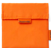
Pantone 021 U