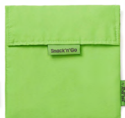
Pantone 375 U