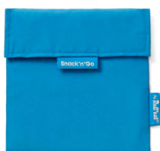
Pantone 2382 U