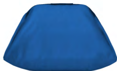
Pantone 301 U